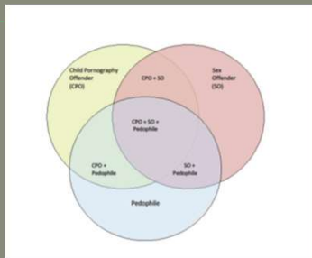
Relationship Among Child Pornography Offenders, Pedophiles, and Other Sex Offenders United States Sentencing Commission, 2013 (does not reflect actual percentages)